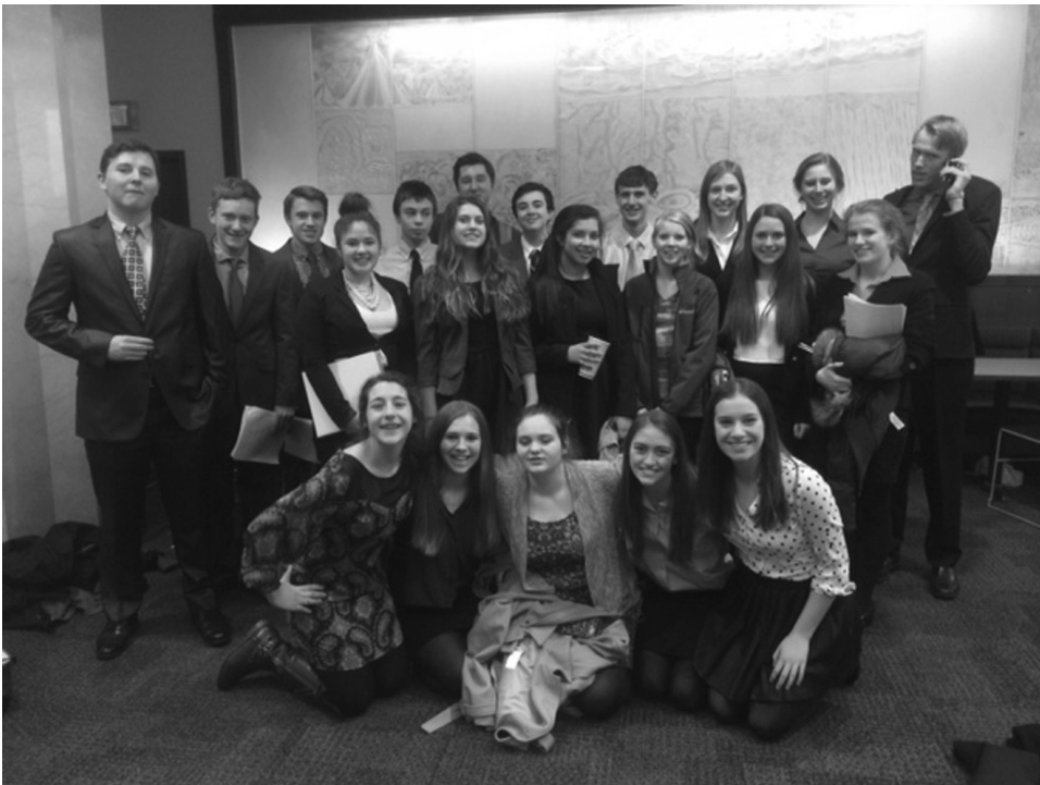
The CDH Mock Trial team