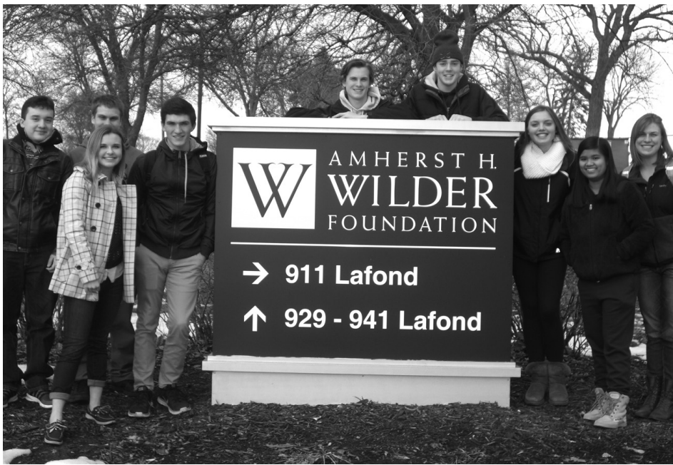
January Leap Forward for Children group.