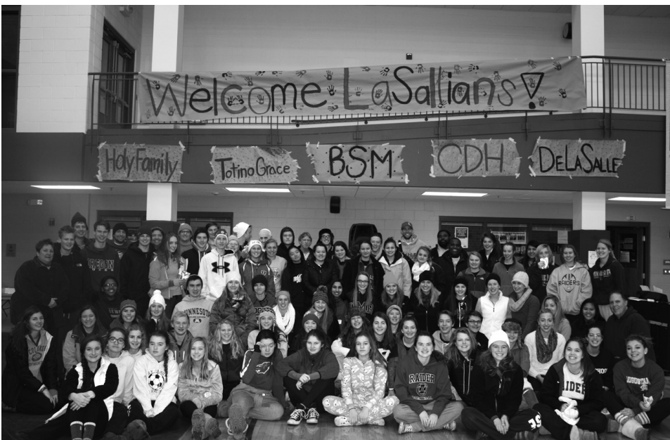
Participants in the Night to End Homelessness

The following CDH students and staff participated in our night: