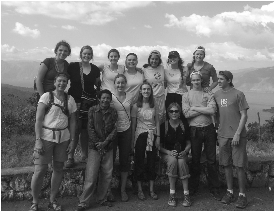
Participants on the December 2014 Guatemala trip.

On a snowy morning in December 2014, after a fun filled night of Silver Bell festivities, 14 bleary eyed students and chaperones boarded a plane bound for Guatemala. The destination was San Lucas Toliman, a quaint little town bordering a volcanic lake in the Guatemalan highlands.