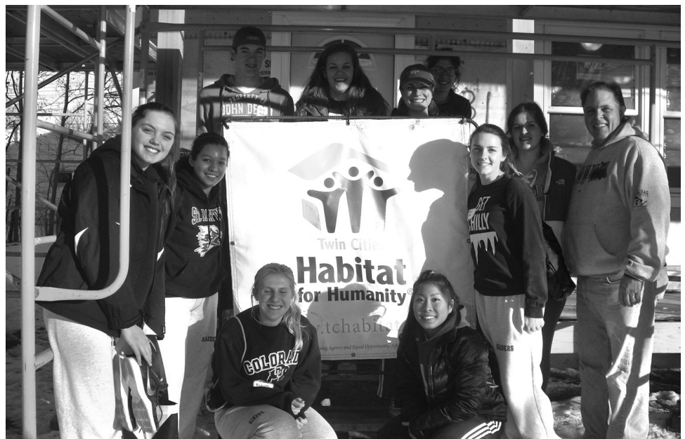
January Habitat for Humanity building group.