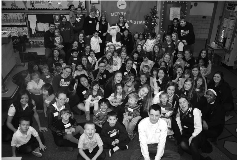
LaSallian Youth 2014 Christmas Party