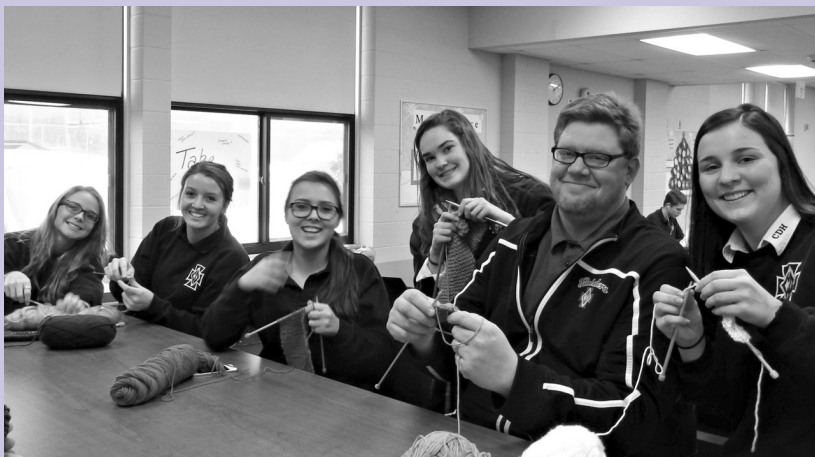
Knitters in the Makerspace area show off their technique.