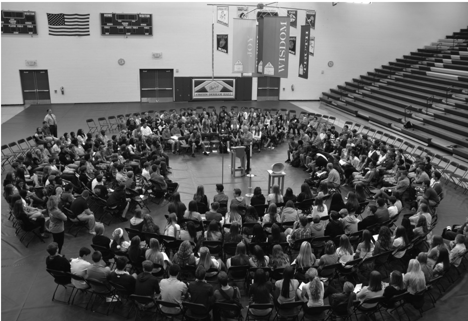
Incoming 9th graders, Class of 2019, began the year by celebrating with a special prayer service. After the students were seated, the faculty and staff surrounded them for a special blessing.