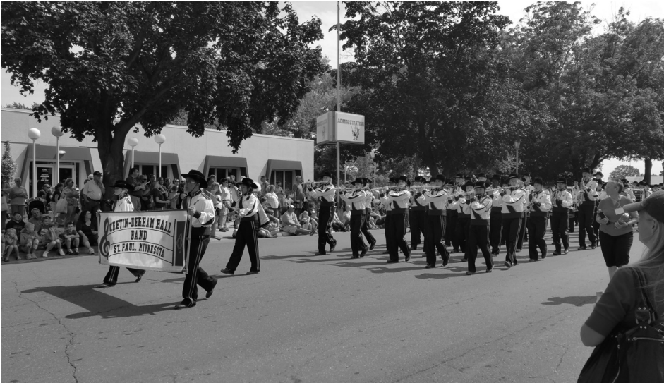
The CDH Marching Band, with 84 members from all grades, entertained fair attendees this past August at the Minnesota State Fair. The CDH Marching Band has performed at the State Fair every year since 1998.

World's Finest Chocolate Sale in late November and December. Proceeds from these fundraisers go toward band trips taken every other year. Next March, the band will be traveling to Chicago; stay tuned for more details! We thank everyone for your support of these various fundraisers! Even more important, we hope that you will also support the band members by attending the various concerts throughout the year! Show your school spirit by supporting a variety of events—band, choir, theater, sports, etc.